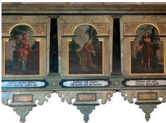
The paintings on the gallery railing depict apostles and martyrs. The paintings were painted by Jonas Bergman in 1757.